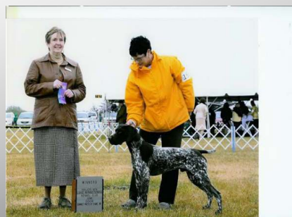
Rukkus 3 pt major