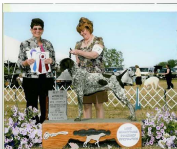
Secret new champion